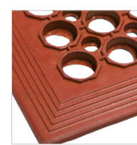
Terracotta - Grease Proof (GP)