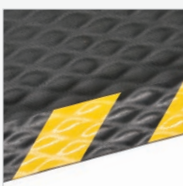
Chevron Border (YB)