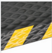
Chevron Border (YB)