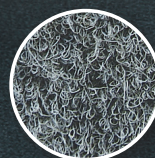
Slate Grey (Carpet)